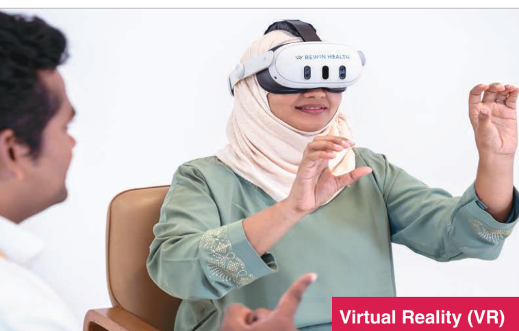
Virtual Reality (VR)

Enables activities of daily living and reduces fall risk.