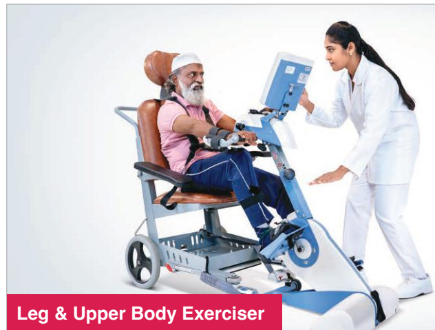
Leg & Upper Body Exerciser

Strengthens both upper and lower limbs for improved mobility.