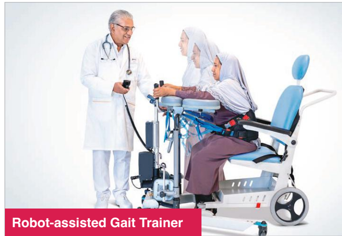
Robot-assisted Gait Trainer

To help stabilise their blood pressure and facilitate weight bearing, for patients confined to bed.