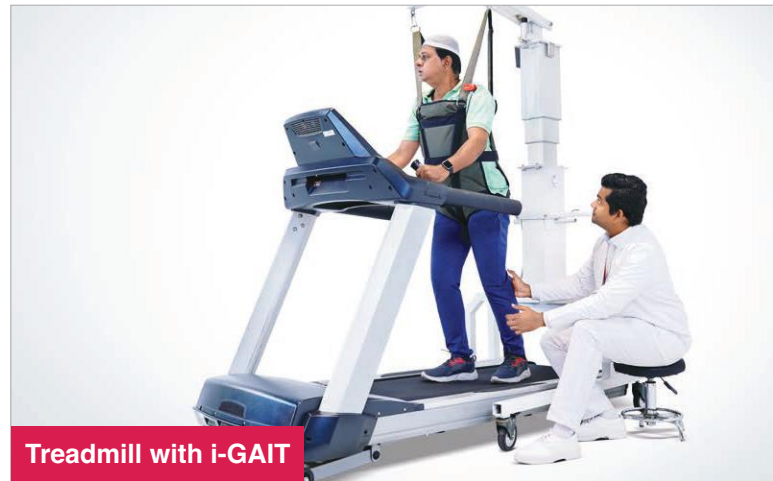
Treadmill with i-GAIT

Improves static and dynamic standing balance for patients unable to stand for long periods.